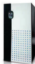
DPS Series 160-500 kVA