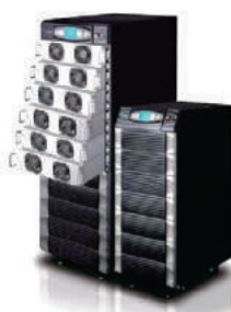
NH Plus Series 20-120 kVA