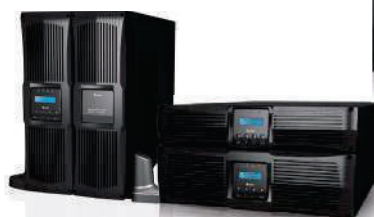
R / RT Series 1-10 kVA