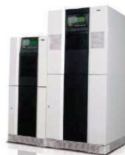
NT Series 20-500 kVA