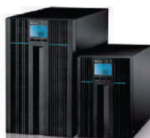
N Series 1-10 kVA