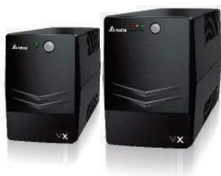
VX Series 600/1000 VA