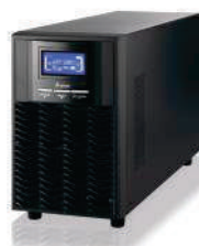
INX Series 1 - 3 kVA